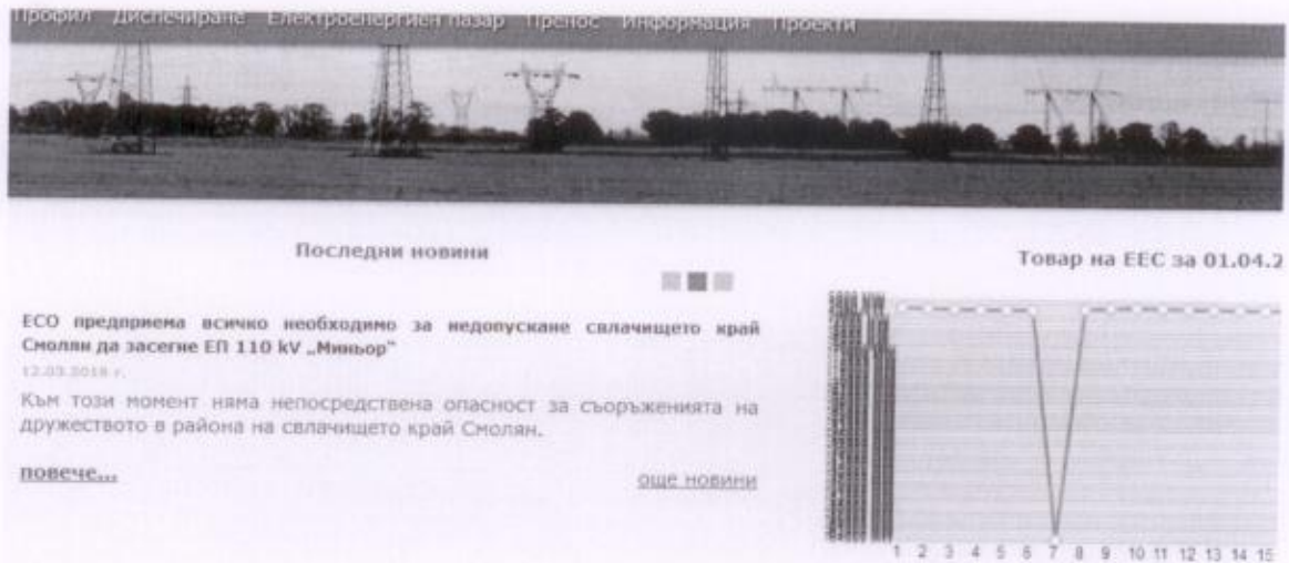
fig. 2 The main page of the TSO's website on April 2 nd , 2018